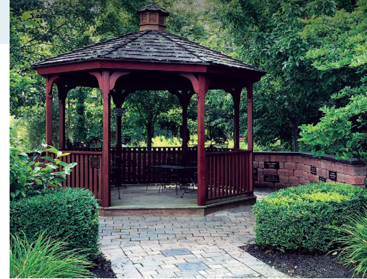
Gazebo Walkway & Wall

Questions? Please call the Hospice Foundation at (716) 686-8090 or visit HospiceBuffalo.com .