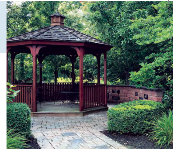
Gazebo Walkway & Wall

Questions? Please call the Hospice Foundation at (716) 686-8090 or visit HospiceBuffalo.com.